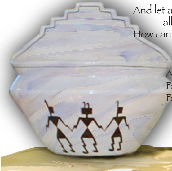
NL Ceramic Baptismal by Sharon Prentice, 1973

And let all the poor come to the water. Bring the ones who are laden to the Lord. Bring the children, without might: easy the load, and light. Come to the Lord.